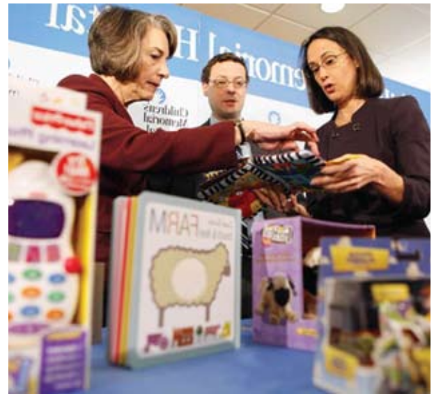
November 24, 2009

The testing is the first since the Consumer Product Safety Improvement Act, signed into law in 2008, decreased the allowable amount of lead and banned the use of six phthalates in children's toys.